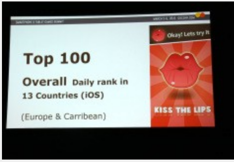
"Kissing Test" has been in the top 100 containing 13 countries