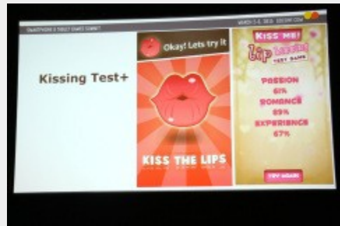
Typical kiss game "Kissing Test"