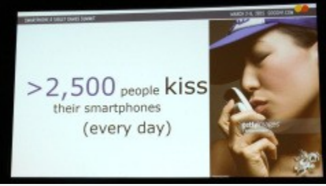
There are people to kiss smartphone