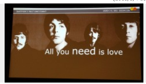
March 2 to 6 held

Venue: San Francisco Moscone Convention Center